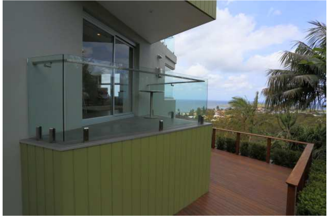
Private balcony and timber deck attached to the studio.