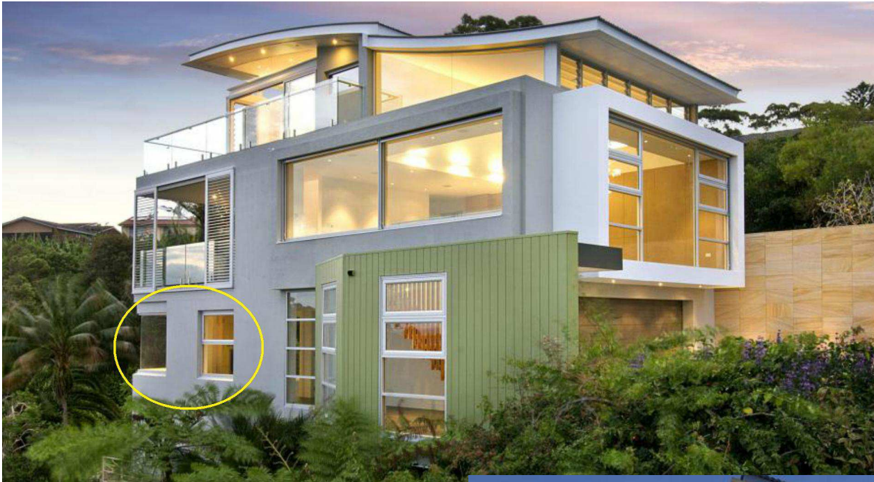
Collaroy building (studio eastern windows circled!) and and the street front view