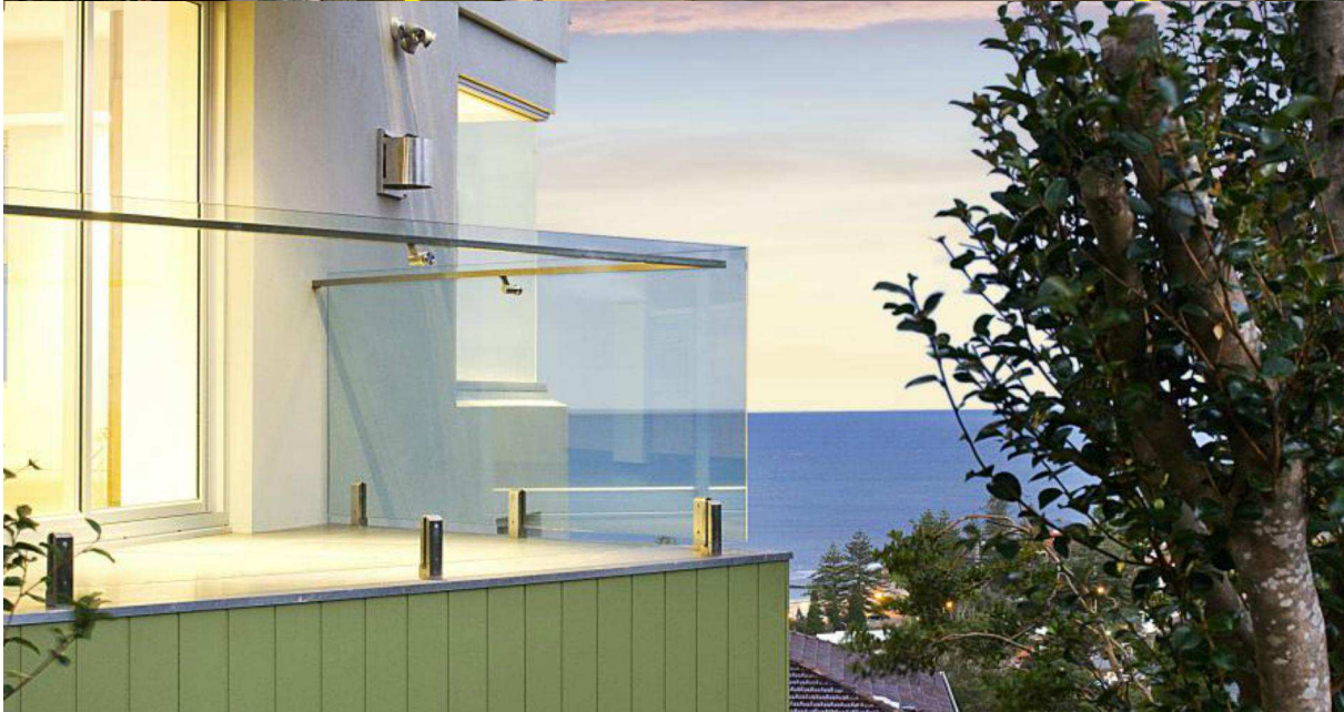
The balcony of the Collaroy studio