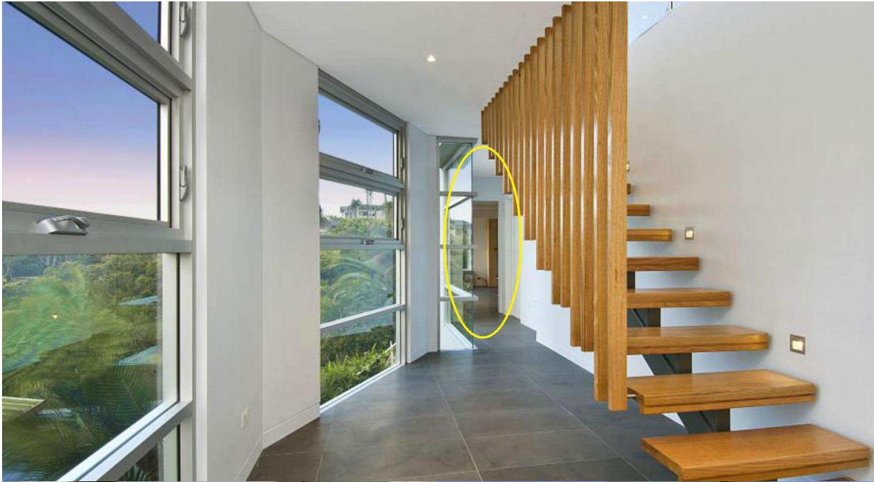
The entry to the ground floor self-contained studio and the view from the studio door