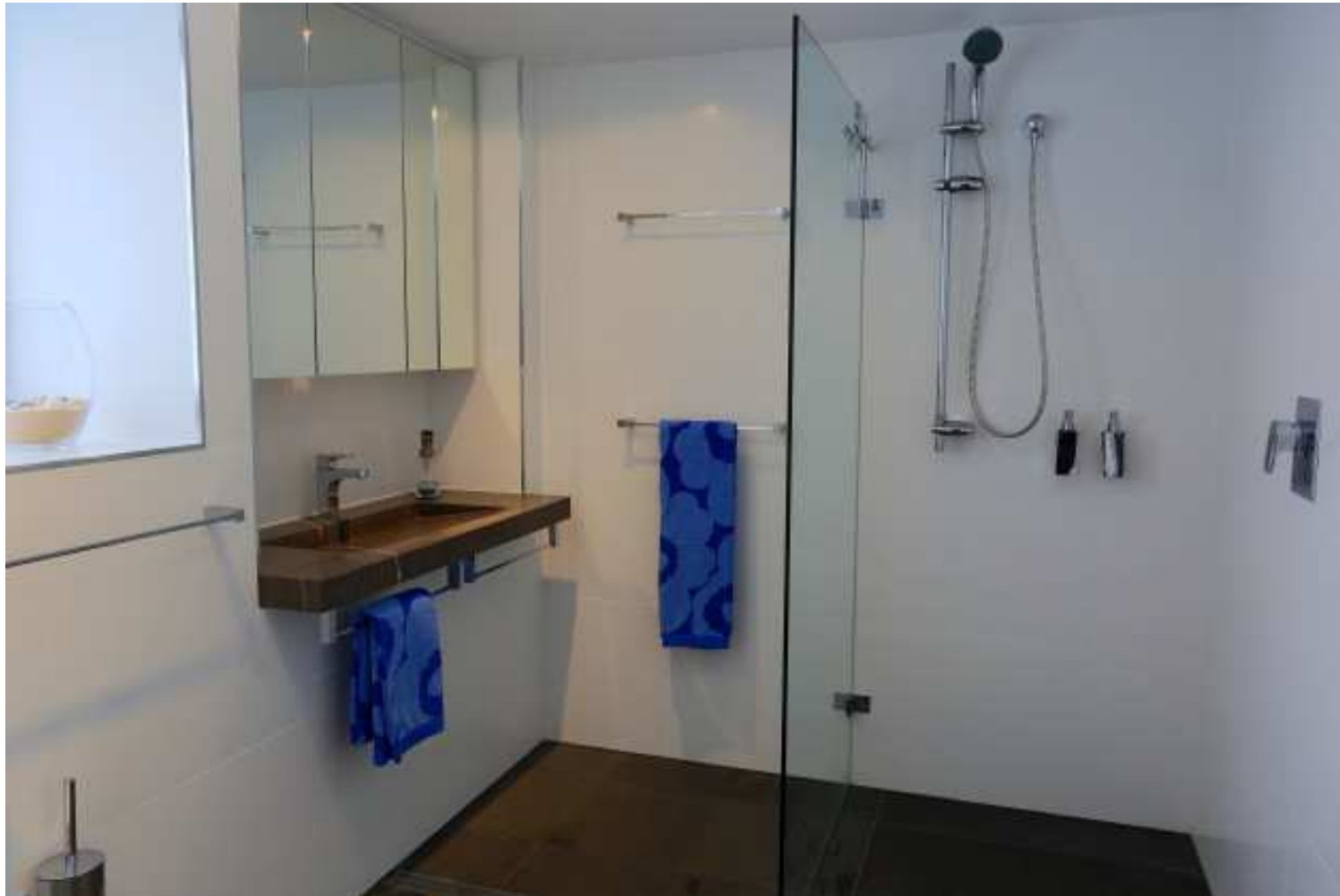
Modern bathroom with shower and custom made vanity unit.